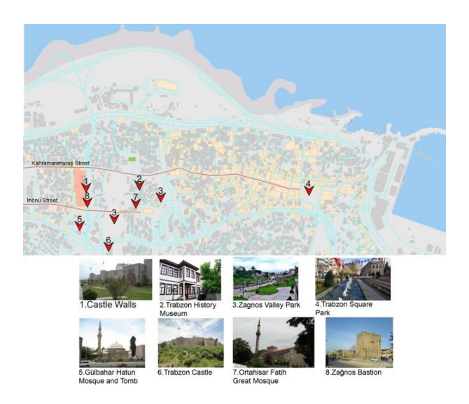
Figure 1. Important areas in Trabzon

In the competition statement prepared by Trabzon Municipality APK Directorate, it is stated that the city developed having a single center due to the limited land facilities, and the aim is to create different centers for the revival of the city. The building subject to the competition is believed to become another center by installing a Municipality Service Building and a shopping mall which would contribute to the revitalization of its immediate vicinity. In summary, the subject of the competition takes into account the characteristics of the historical building and its surroundings, re-evaluating and planning the building in a way that it accommodates the Municipality Service Building and the shopping mall. As specified in Competition Statement, suggestions to be developed by the competitors are expected to relate the meaningful task of the building in the memories of the city that could be sustained in the future, and at the same time should give a new vision to the city of Trabzon.