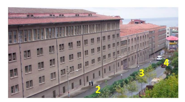
Figure 9. The eastern facade, (competition statement, 2006)

1: Administration = Administration for Shopping Mall (completely demolished, rebuilt similar to the original), 2: Production Department = Shopping Mall (completely demolished, rebuilt similar to the original), 3: Refectory = Assembly Hall (completely demolished, built a new design: different from the original and the project designed), 4: Storage = Municipality Service Building (completely demolished, a new design is built: different from the original).