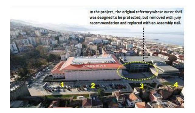
Figure 11. The eastern facade of the present shopping mall