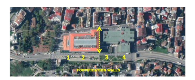
Şekil 8. The project applied

1: Administration = Administration for Shopping Mall (completely demolished, rebuilt similar to the original), 2: Production Department = Shopping Mall (completely demolished, rebuilt similar to the original), 3: Refectory = Assembly Hall (completely demolished, built a new design: different from the original and the project designed), 4: Storage = Municipality Service Building (completely demolished, a new design is built: different from the original).