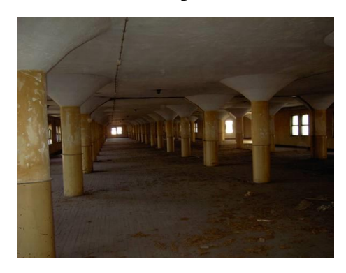
Figure 4. Building 3, flooring system (Competition Statement, 2006).

Statement. In the competition proposal of MTF Project for the Municipal Service Building, the new design has no similarity with the historical and neither a dialogue with the historical five-story Production Building in the south (Building 2). Besides, the Production Building (Building 2) is proposed in the design as a shopping mall by demolishing most of its parts except the load bearing walls. In the competition proposal, the middle block in the east (Building 3) is preserved together with the flooring systems and be functioned to be an exhibition hall as part of the mall (Fig. 4 and Fig. 5).