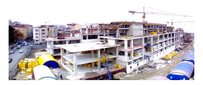
Figure 7. Trabzon Tekel Cigarette Factory land, shopping mall construction phase 2009