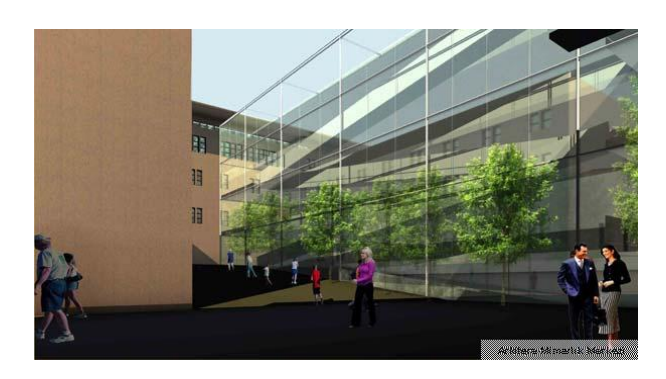
Figure 14. The competition visual