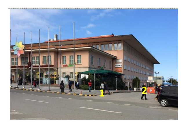
Figure 19. Shopping mall eastern facade (Müberra Kabataş archive, 2019)