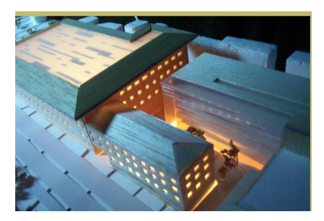
Figure 13. The competition visual