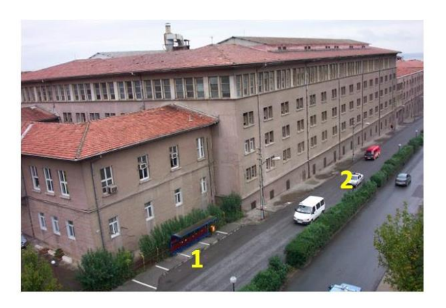
Figure 18. The eastern facade (competition statement, 2006)