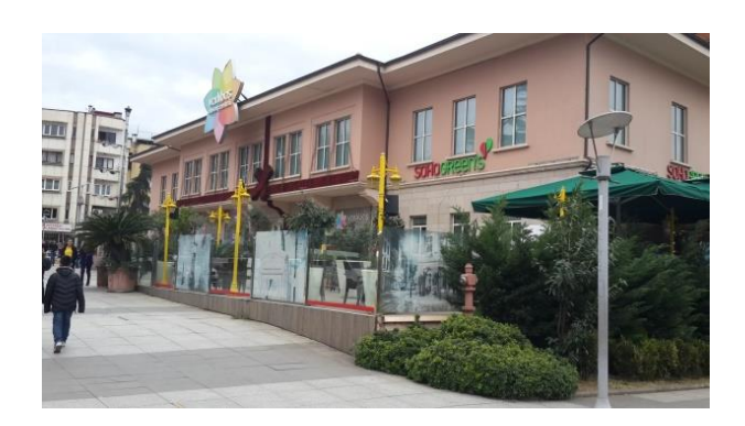
Figure 17. Building 1, 2018