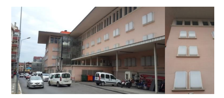
Figure 20. The Western facade and the window detail

Although the plan scheme of this shopping mall seems to have inspired from the plan scheme of the Tekel Cigarette Factory, at present there is nothing offered different than the traditional shopping mall plan type with an atrium. In other words, it is an example of an atrium bazaar type but with its exterior, tries to repeat the history (Fig. 21 and Fig. 22).