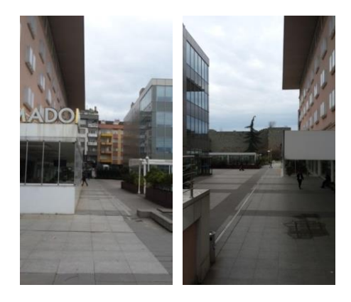
Figure 12. The pedestrian passage between Municipal Service Building and the Shopping Mall (view from east and west)