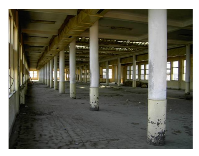
Figure 21. Production building (building 1) (competition statement, 2006).